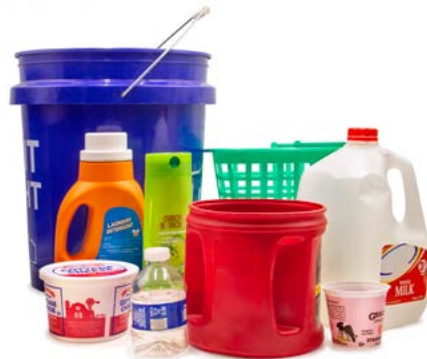
Plastic bottles & containers