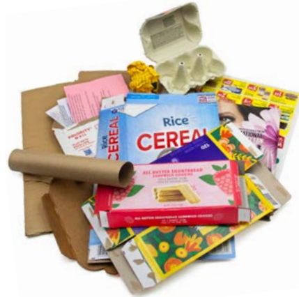
Clean paper, flattened cardboard & paperboard