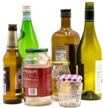
Glass bottles & jars