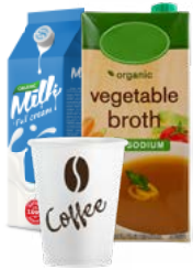
Coated paper & cartons