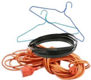
Cords, chains, clothes hangers