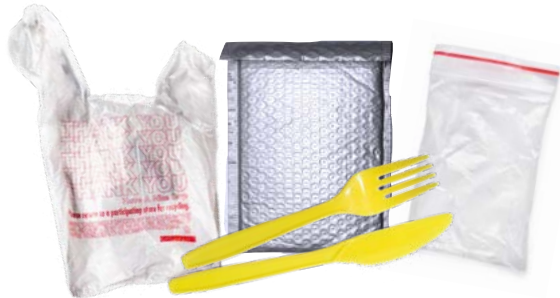
Plastic bags, utensils, film plastics