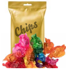
Chip bags & candy wrappers