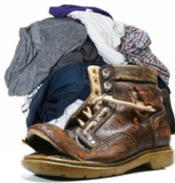
Clothing, shoes, blankets