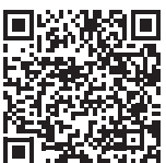
To-go cups, Cartons & Plastic Bags

Visit SacGreenTeam.com for digital resources: letter templates, lease language, translated brochures, and more.