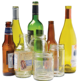
Glass bottles & jars