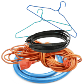
Hoses, cords, chains, clothes hangers