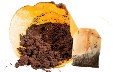
Coffee grounds, paper filters, tea bags