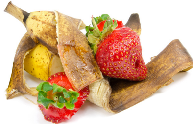
Fruits & vegetables