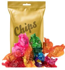
Chip bags & candy wrappers