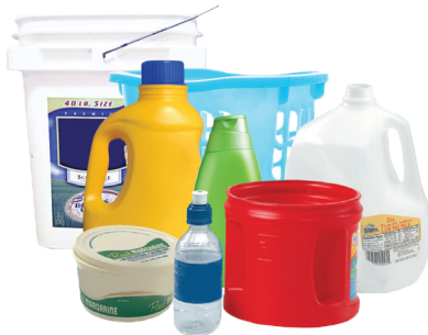
Plastic bottles & containers