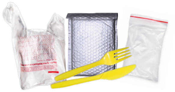
Plastic bags, utensils, film plastics