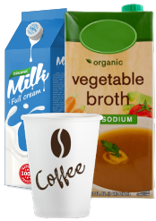
Coated paper & cartons