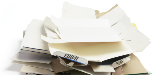
Clean flattened cardboard & paperboard