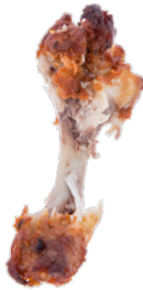
Meat scraps & bones