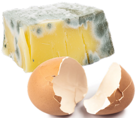
Cheese & eggshells