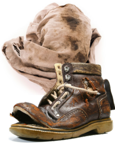
Clothing, shoes, blankets