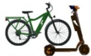
Electric Bicycle / Electric Scooter Do not remove battery