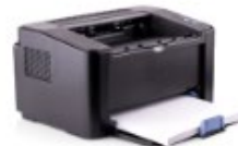
Copiers (only residential copiers accepted free)