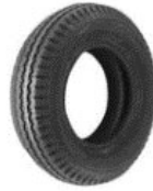
Tires- Passenger Vehicle/Light Truck (limit 4 per day)

Bulky Items: Tires (passenger vehicle/light truck* (limit 4 per day) [1 Passenger Vehicle/Light Truck Tire = 50 Bicycle Tires]; Mattresses/box springs; Clean metals