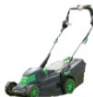
Electric Battery Lawn Mower Remove battery, drop-off at Household Hazardous Waste

*Before dropping off e-waste for recycling, protect your personal information. Any personal data stored on e-waste should be permanently erase by using disk cleaning software, hard resets, memory card removal, overwriting commands, etc. Learn about electronic disposal best practices.