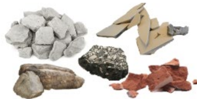
Asphalt, Tiles, Rocks, & Stucco (clean, no dirt, no trash, no rebar)

Have questions? Email, SacGreenTeam@SacCounty.gov